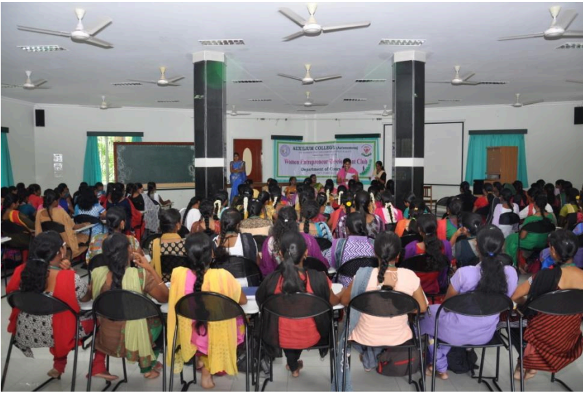
Photos of Activities done by the students at Indoor stadium on 29 th Jan 2020