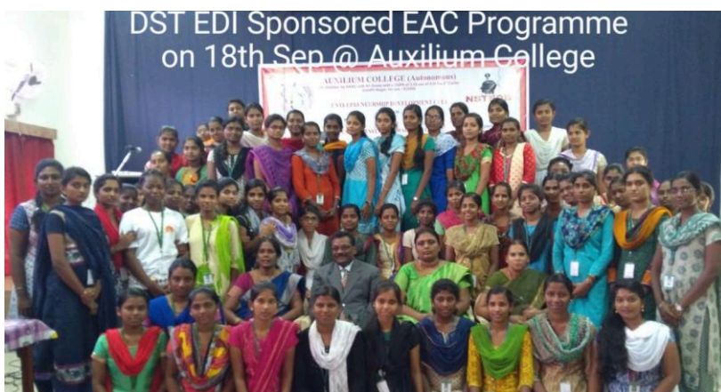
Group Photo taken on the September month event